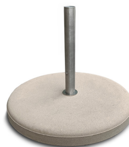
Concrete - natural