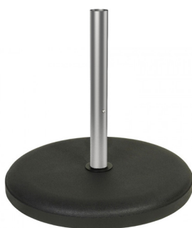
Black - Ral 9005